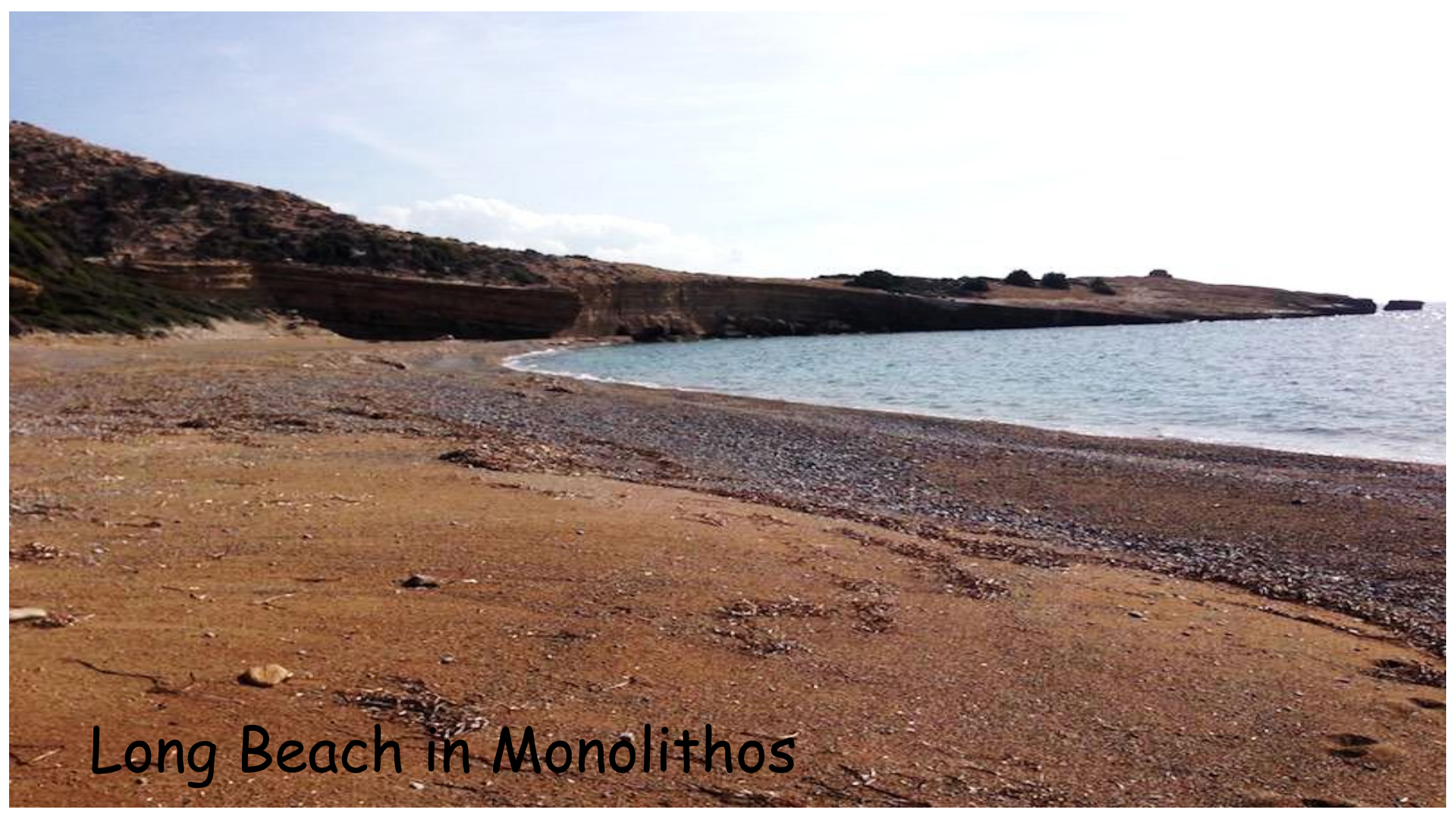
Long Beach in Monolithos