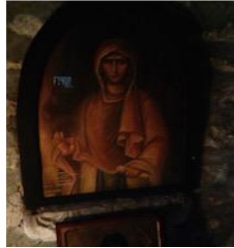
Religious Monuments in Monolithos -Rhodes